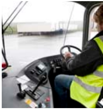
Large windows and angled corners without A-pillars provide excellent all-round visibility.

The TT612d distribution tractor's strength, high-quality design and common components guarantee maximum uptime and keep distribution centre operations on the move. With long lifetime expectancy, this tractor has been built to perform even in the harshest conditions. Busy distribution centres and depots are no place for lightweights, so the Kalmar distribution tractor boasts the strongest frame in the industry.