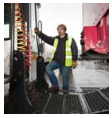
Wide stairways, sturdy handles and even rear deck increase productivity and safety.