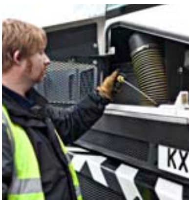
PURPOSE-BUILT DISTRIBUTION TRACTOR