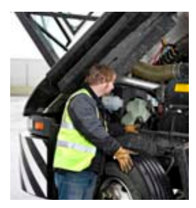
The cabin can be lifted electrically for easy access to engine compartment.