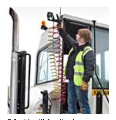
Tall cabin with functional rear doorway – only one low step to rear deck.