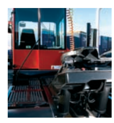
Two double-acting hydraulic cylinders for faster trailer lifting and lowering.