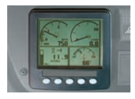
Multi-functional display: all data available at a glance including diagnostics information.